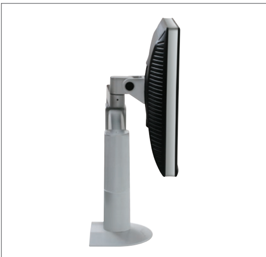
Folds to save maximum space