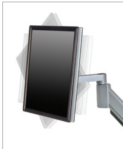
Monitor pivots from landscape to portrait