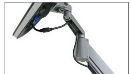
Integrated cable management

Phone: 1300 798 050 | Fax: 1300 798 052 | E-mail: enquiry@lcdmonitorarms.com.au | Web: www.lcdmonitorarms.com.au